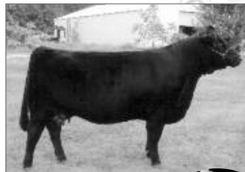
CBLR Matraca 471N Ref Dam of Lot 80