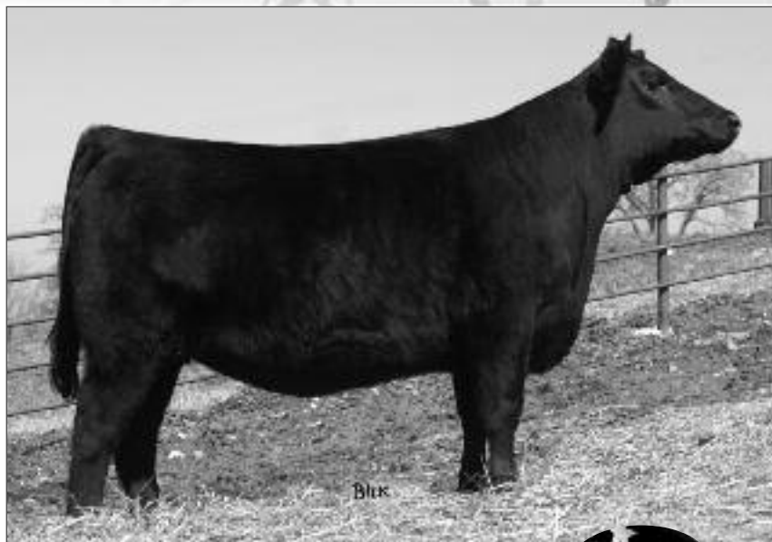
CALO Way Down 206W 4