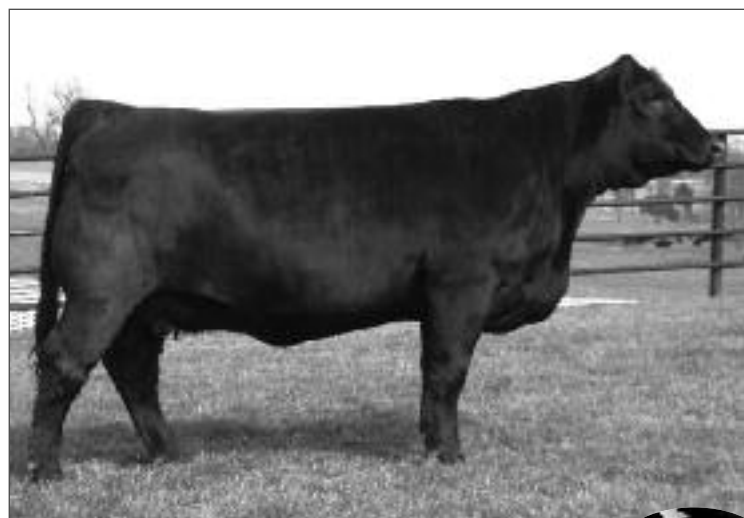
KRVN Trendy Lady 151T 43

Trendy Lady is a homozygous black, extremely deep-bodied heifer, sired by the former National Champion, DHVO Deuce. You can't pass up the opportunity to buy such a heifer with high milk numbers combined with a soggy look.