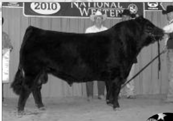
EXLR Unequaled 051U Sire of Lot 18