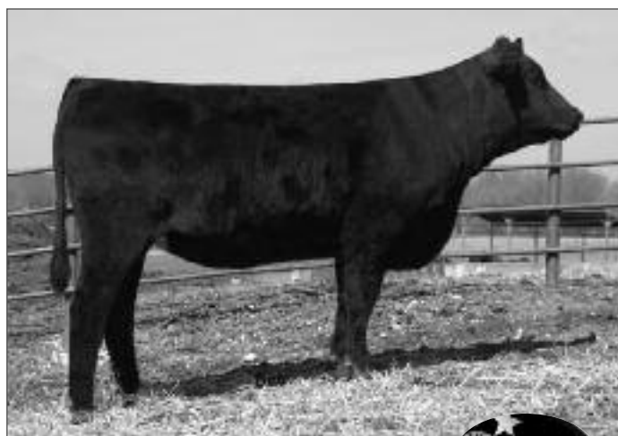
CALO 210W 5

This February Lim-Flex females is powerfully constructed and popularly bred. She has extraordinary numbers, and she is a true breeding piece for the future generations. The progeny of IVLS Secret Weapon are among the most respected in the Limousin industry.