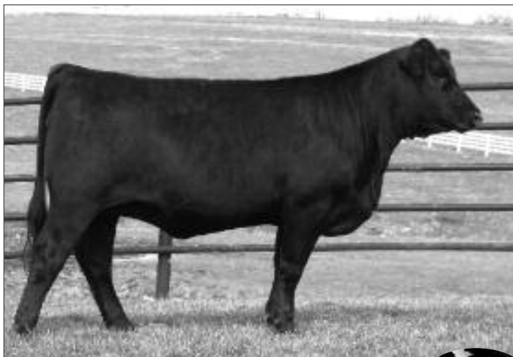
AUTO Ariel 266U 44

AUTO Ariel 266U is a homozygous black, homozygous polled, moderate framed heifer. Ariel is definitely a show heifer prospect with a clean front end and overall eye-appeal. Her full sister sold to Lauren Stowers in Bridgeport, Texas.