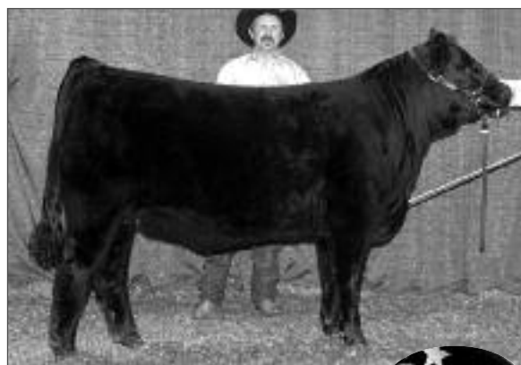
CLLL Mongoose 15S Dam of Lot 18