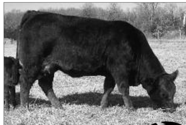
M&R Miss Weapon Hunt 178U 25