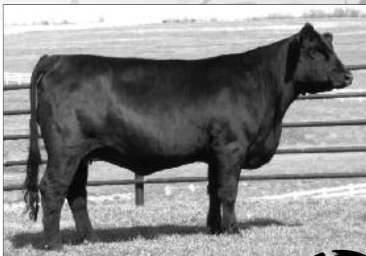
AUTO Tipper 281T 45