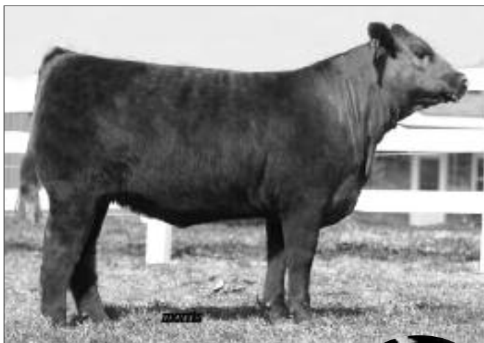
SCUN Tarnished Angel 211T Daughter of EXLR Luvly 222R

EXLR Luvly 222R is one of the leading Lim-Flex females in the Limousin Industry and one of the best direct daughters of EXLR Luvly 084F. She produced the excellent female SCUN Tarnished Angel 211T. The daughter of KRVN Naskar 013N was the top-selling female at the 2008 American Pie Sale and now co-owned by Abele Cattle Co. and Jones and Benson Limousin. These embryos by LH Rodemaster make a complete and valuable genetic combination.