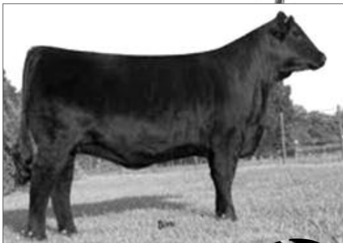
PBRS Up Town Girl 48U 14

Embryo Flush (guaranteeing 5 embryos to the bull of buyer's choice) PBRS Up Town Girl 48U is a brilliant double homozygous Lim-Flex female from the Abele donor program. The successful former show heifer is one of the most impressive young females in the industry. Her sire, DHVO Trey 133R, is siring competitive show cattle and efficient and growthy progeny. The cow families of both sire and dam are proven good milking lines.