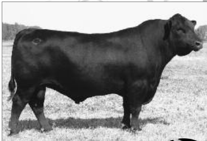
MYTTY In Focus Ref Sire of Lot 38