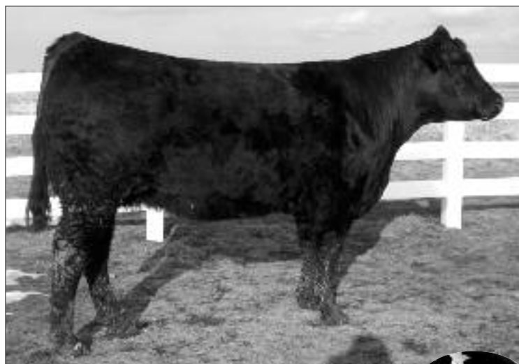
LFL Sharon Jean 6022S 47

Due 5-14-10 to AUTO Bookkeeper 116U This heifer has a great pedigree going back to the Luvly cow family on the dam side. She is big and super stout. Don't miss the chance to improve your herd with numbers like hers.