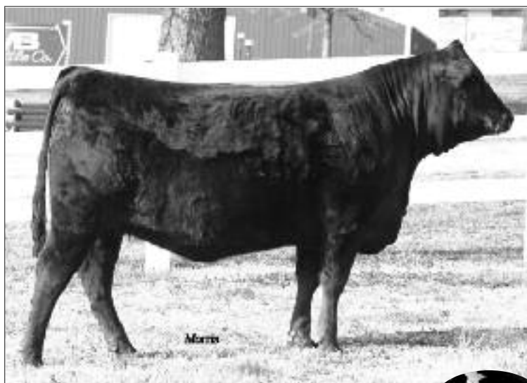
HB Unequaled 853U 31

GPFF BLAQUE RULON TUBB FIRST CLASS 666F COLE FIRST DOWN 46D COLE CATALINA 3309C S A F BANKER S A F RITA 5234 S A F POWER FIX G D A R SUSANNA 3230