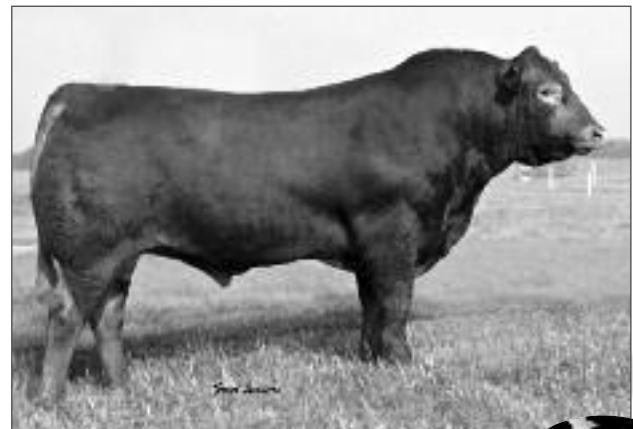
EAFF Polled Platinum 515N Ref Sire of Lot 54 & 55

PE 9-1-09 to 3-20-10 to EAFF Polled Platinum This polled, fullblood female is moderate and represents low birth-weight and calving ease genetics. The female is one of the most eye-appealing of the Fisher consignments.