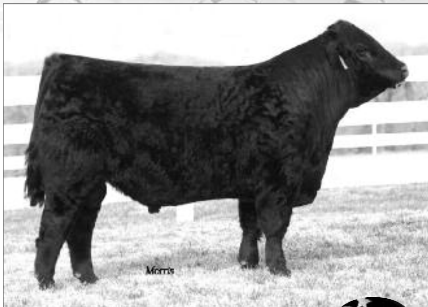
BBPB Winchester 64W 80