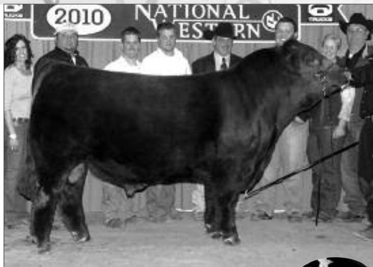
Shilling's Unforgiven Ref Service Sire of Lots 33 & 34

This is another one of the good bred females from the Baker Limousin program. This female carries the service of the 2010 National Western Grand Champion Bull, Shilling's Unforgiven.