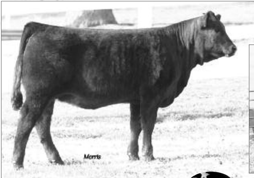
HBRL Waddle 958W