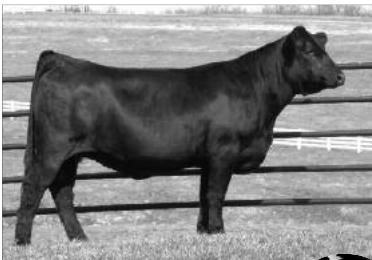
AUTO Destiny 209U 46

Due 5-19-10 to AUTO Bookkeeper 116U Don't miss a last chance to buy a daughter of the great, and now deceased, Edith. Tipper is stout in her frame and combines that with a great set of numbers.