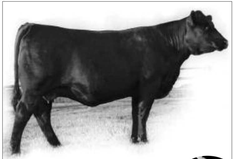
BLEL Casual 649S