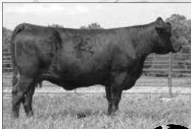
HUNT Lafayette 07L 24