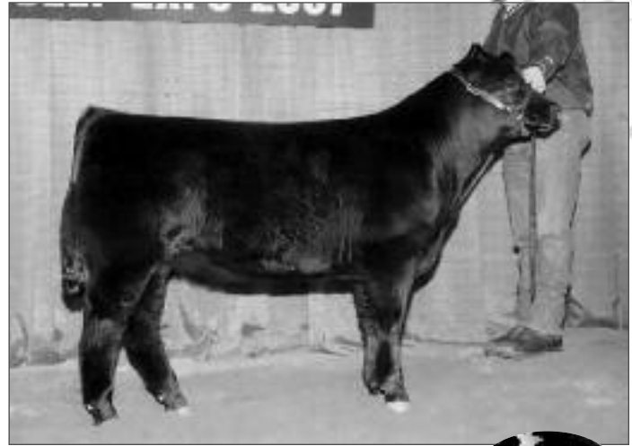
VL Shelby 52

PE 8-18-09 to 11-1-09 to VL Stock Trader VL Shelby is a young Law Dog female who was Champion Limousin Female at the 2007 Iowa Beef Expo. She is bred to VL Stock Trader.