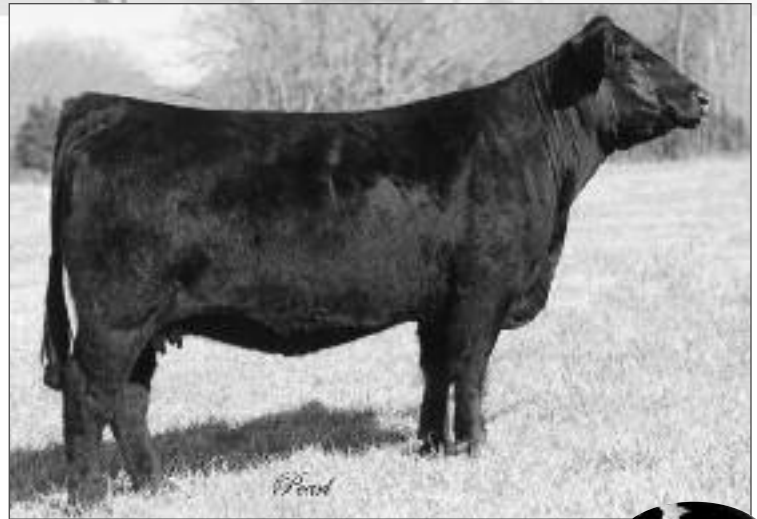
MAGS Rattle 48