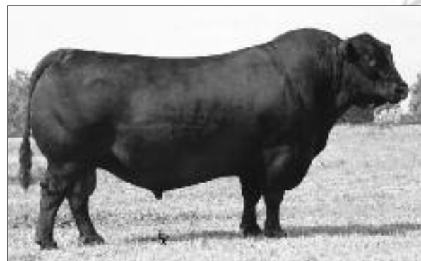
SAV Final Answer Ref Sire of Lot 4