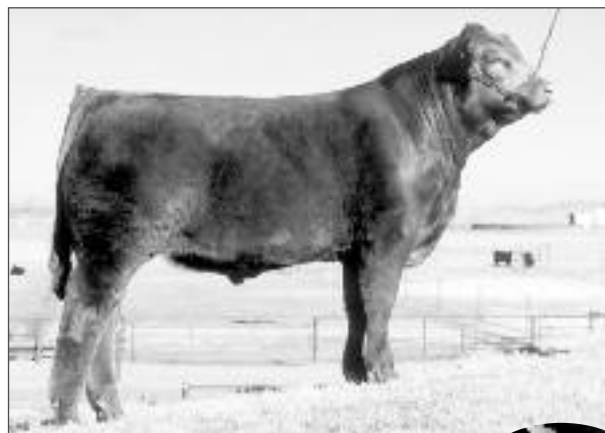
Wulfs Kolton 7526K Ref Sire of Lots 39 & 41

Will calve by sale day to WLR Thrill Seeker CC's Mitty Pretty 244U features a popular, proven Lim-Flex pedigree. The Mytty in Focus daughters are making great cows. The mating of this broody, feminine heifer to Thrill Seeker could result in a homozygous polled, homozygous black calf. WLR Thrill Seeker is a full brother to the leading AI sire WLR Direct Hit.