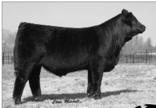
MNWS Frontier 507R 80 Sire of Lot 81

CC's Frontliner 001U is a nicely balanced son of MNWS Frontier 507R. He is from a daughter of EXLR Dakota 353G, and he will be a great bull for producing replacement heifers.