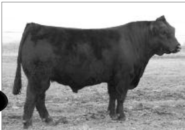
DHVO Deuce 132R Sire of Lot 19

If you are looking for mating of quality Lim-Flex genetics, this is for you.