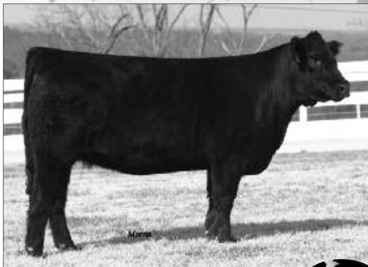
BBPB Sugarland 34U 30