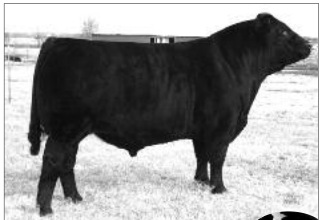
EF Smack Down 764S Ref Sire of Lot79

Selling 2/3 interest and full possession CC's Uncapped 607U is an impressive Lim-Flex sire from the CC's Delight program. The son of EF Smack Down 764S was a Reserve Division Champion at the National Western Stock Show. The homozygous polled, rugged herdsire is big-footed, big-boned and has an excellent disposition. CC's Uncapped 607U is a real herdsire prospect for the purebred, Lim-Flex or commercial breeder.