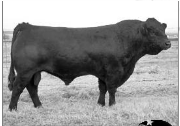
JCL Lodestar 27L Ref Sire of Lots 20A & 21A