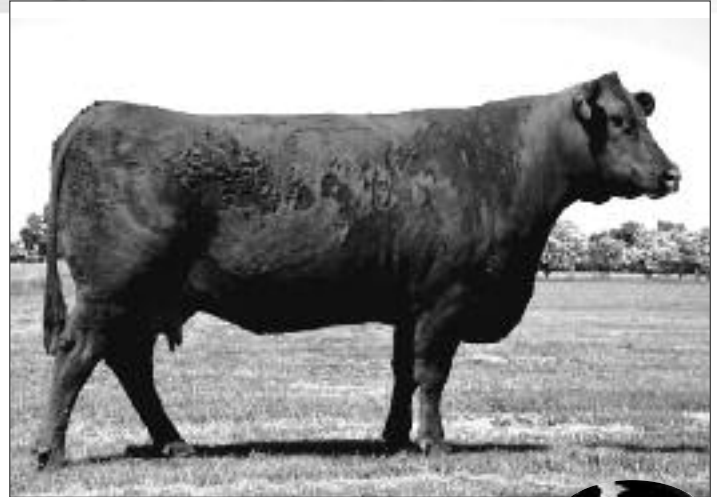
MAGS 10M Dam of Lot 82

Looking for a bull to move your Lim-Flex program down the road? WLR U-haul offers a great combination of EPDs, conformation and a quiet disposition. Sired by the leading Angus bull, GAR Predestined and out of a broody, deep-bodied Wulfs Fanfare daughter, this bull is bred to take your herd in the right direction.