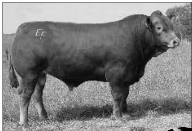
EAFF Polled Muscatel 659R Sire of Lots 56 - 60

PE 9-1-09 to 3-20-10 to EAFF Polled Platinum Muscateles Lady 898 is one of the superior females in the offering. She traces back to some of the strongest of EPD and performance lines.