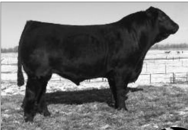
Wulfs Nobel Prize 3861N

This son of COLE Magnum is homozygous for the polled and black traits. He has only a 76 lb. birth weight, good performance,, and he is an ideal bull for use on heifers.