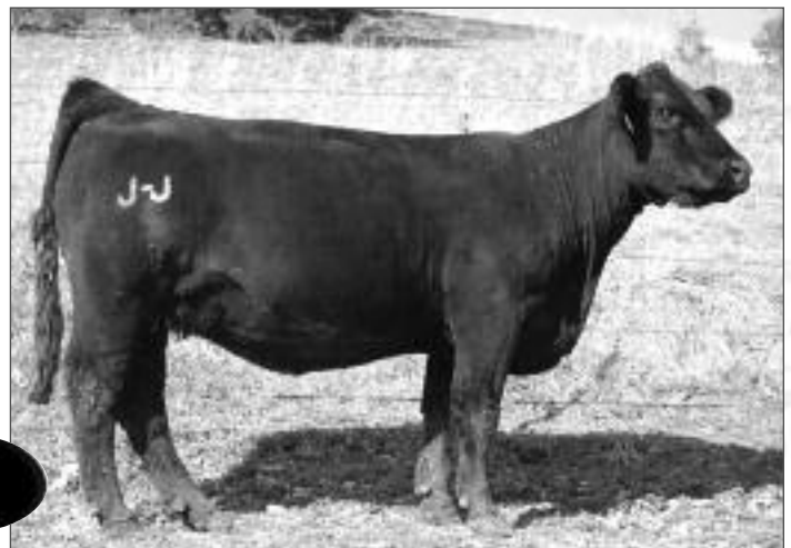
J Bar J Snap 639S 21

J Bar J Snap 639S is a Lim-Flex female of the highest quality and genetic popularity. The daughter of LESF Asphalt 9N is from one of the great foundation Lim-Flex females in the industry. Her purebred heifer calf by JCL Lodestar 27L is a high performing and high quality individual. The female carries the service of MAGS Unoriginal, the full brother to AUTO Dollar General.