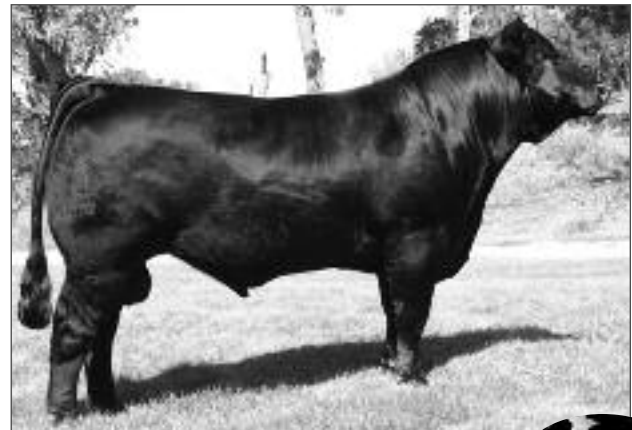
VL Stock Trader Ref Service Sire to several Double E Lots

VL Taffetta is hard to part with; she is a real sweetheart. Out of Law Dog and a super cow. She was shown in 2008. She did a great job with her first calf, and she is a great mother.