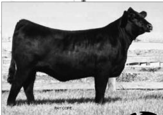
AUTO Christy 8889R Dam of Lot 17