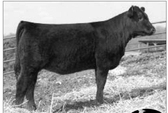
CALO Wendy 901W