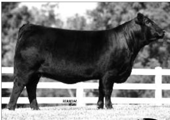
FULC Groovy Girl 1101R 15

Selling the right to flush to the bull of breeder's choice Buyer pays all expenses Guaranteed a minimum of 5 eggs and maximum of 10 eggs FULC Groovy Girl 1101R is one of the most popular females in the Limousin industry. She was campaigned with great success in the show ring and she is now a great proven producer of quality embryos and quality progeny. The daughter of IVLS Wolf Track 7428N is from significant performance lines from both sides of the pedigree.