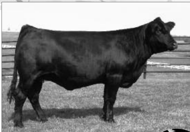
AUTO My Baby 606U 42

A great homozygous polled example of the quality in the Dakota Lady cow family is proven by AUTO My Baby 606U. She combines a good set of numbers along with the look of a great cow.