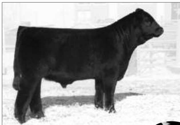
KRVN Naskar 013N 80 Sire of Lot 80