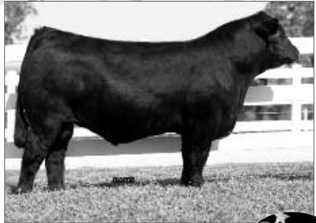
PBRS Saint Anthony 685S

BLEL Casual 649S is from one of the all time great Lim-Flex cow families. The combination of growth and carcass numbers makes this female one of the stand-out individuals and pedigrees in the industry. With a .50 for marbling and 62 $MTI, she is a trait-leading female in several categories.