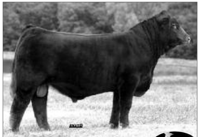
Mags WLR Usual Suspect