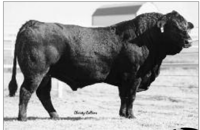
Rads Black Prodigy Ref Sire of Lot 20